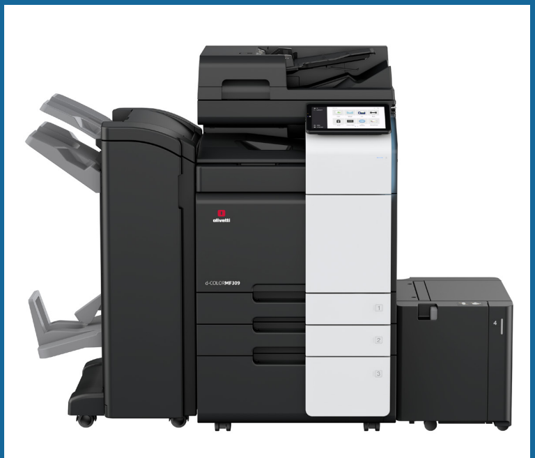
d-Color MF309 with DF-714+PC-416+LU-302+RU-513+FS-536SD

New 10.1" multi-touch operator panel, which can vibrate to provide greater touch sensitivity