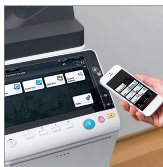
New 10.1" Touch-screen and NFC Authentication Area