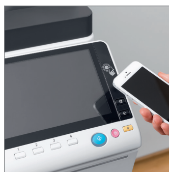
New area for Near Field Communication (NFC) Authentication

AirPrint® , provided as standard, allows printing from an iOS device (from iOS version 4.2 to 10.7 and later) and compatibility with Google Cloud Print , through the installation of a specific software connector.