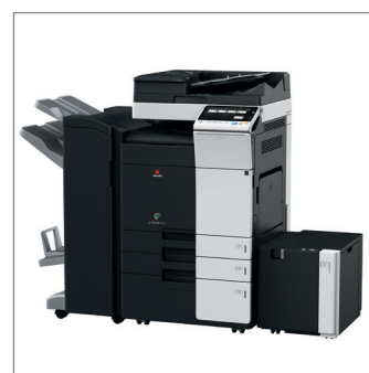
Configuration with FS-534SD Finisher, PC-410 Tray, LU-302 Large Capacity Tray, and DF-704 Document Feeder

On the operator panel there is a special area allowing connection with NFC (Near Field Communication) technology devices for authenticating users or using Bluetooth (optional).